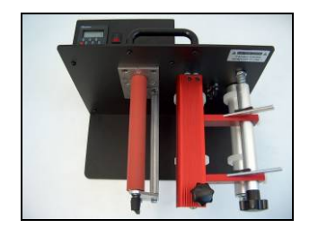
S-100-SP with PC-1