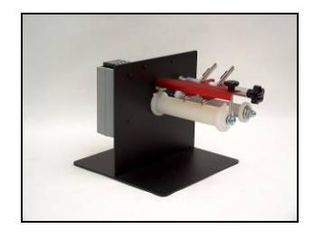
S-100 with PC-1 Counter

The S-100, S-200 & S-100-SP feature a 3-Year Parts and Labour Limited Warranty, the longest in the industry.