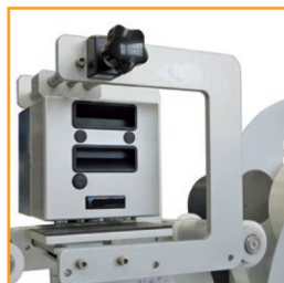
Thermal transfer printers